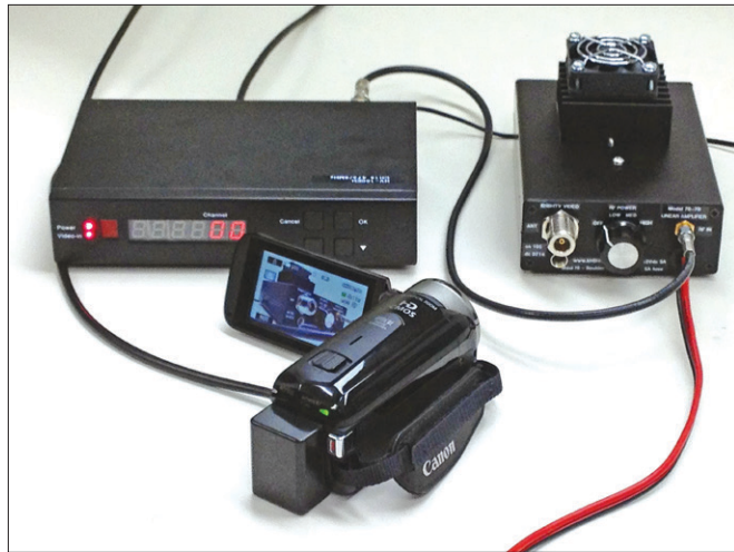
Figure 3 — Complete DVB-T TV transmitter system includes a (left) Hi-Des modulator, (right) 70 centimeter, 300 mW / 1 W / 3 W linear amplifier, and (center) high definition camcorder.

accepts either standard definition (480i) composite, or high definition (up to 1080p) HDMI video inputs. It encodes the video using either MPEG2 or H.264. Both the operating frequency and bandwidth are programmable. The bandwidth can be set from 2 MHz to 8 MHz in 1 MHz steps (6 MHz is the US broadcast standard). At the 2 MHz bandwidth, the modulator is capable of transmitting only standard definition video. You can select either QPSK, 16-QAM, or 64-QAM modulation format. Programming requires an external PC computer and a USB cable. After programming, the computer may be detached from the modulator. The modulator puts out only -3 dBm RF power and is adjustable downward in 1 dB steps. An RF power amplifier is needed to supply reasonable power levels to an antenna. The RF power amplifier must be very linear to avoid distorting the digital signal and creating unacceptable out of channel emissions.